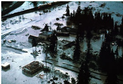
Portage just after the quake, the destruction and flooding clearly visible

Portage is a ghost town on the Turnagain Arm in Alaska , destroyed in the 1964 Alaska earthquake after the ground sank six feet putting most of the town below high tide level. In the spirit of this fact, this event requires the troop/ patrol to portage their assigned equipment in their sled through the obstacle course.